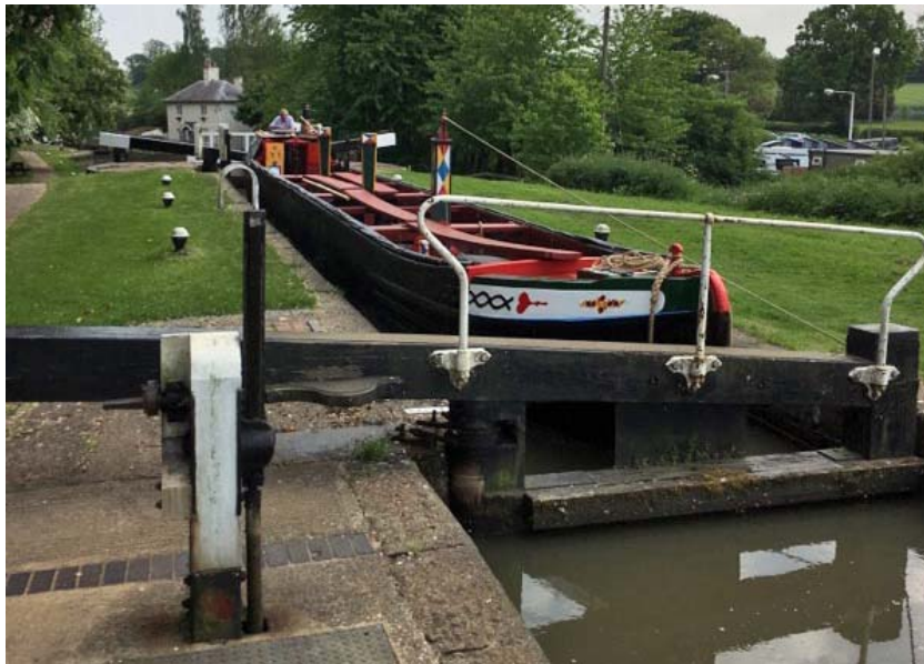
Raymond in Lock 2 at Watford.

The boats finally arrived at Crick Marina soon after 4pm, a good trip under the circumstances. But all was not over yet. The organisers had put the historic boats on to a new site for this year's show and, with only inches to spare in the space available to turn full-length boats on to the allocated moorings, all present were again relieved to have Nick Scarcliffe in charge of the tricky manoeuvre.