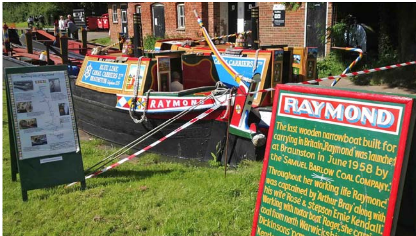
Welford Weekend June 2017.