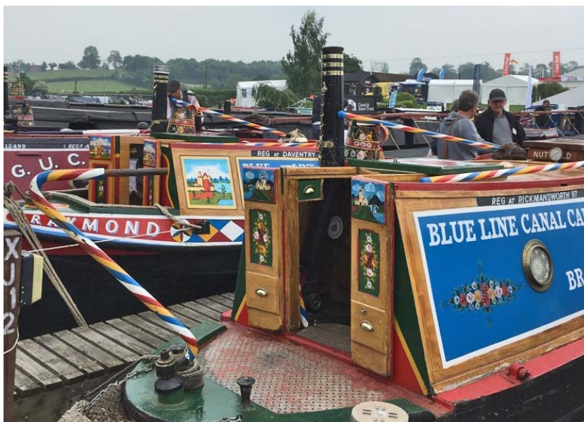
Nutfield & Raymond at the show beside the Waterways Museum's Sculptor.