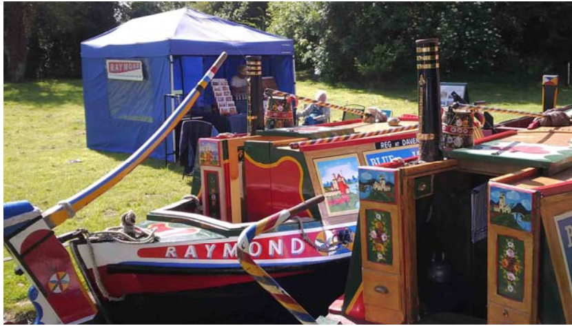
Welford Weekend June 2017.