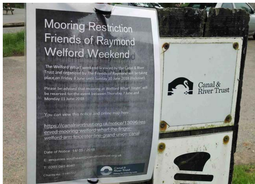
Mooring restriction notice Welford Wharf 29 May.