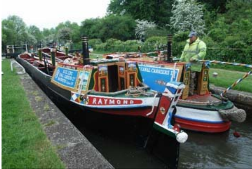
Braunston Top Lock, Nick Scarcliffe on Nutfield .