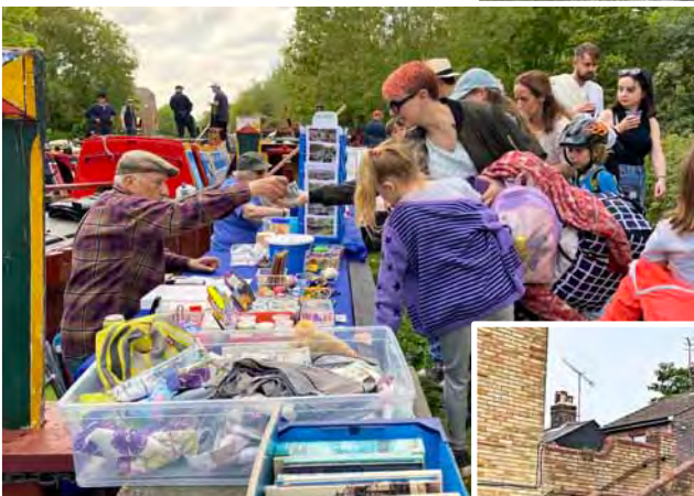
May: at the Ricky Festival