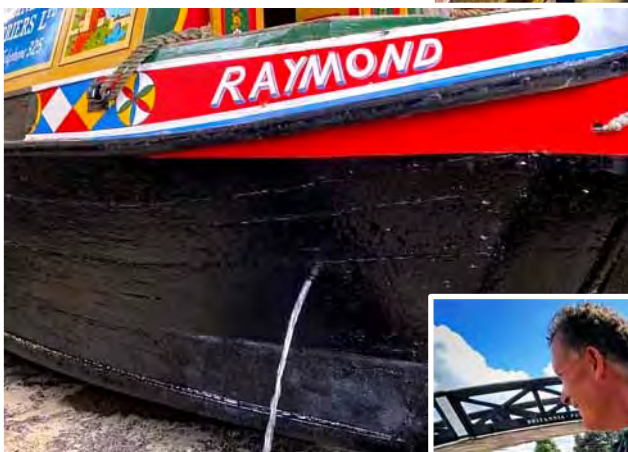
August: ...and proving the pumps work!