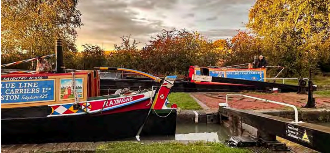
Sunshine after the rain. September evening at Hillmorton