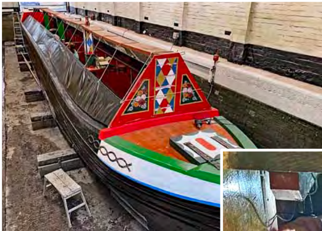
August: Raymond with new side cloths