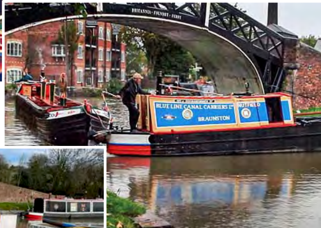
September: round Suttons again, going home