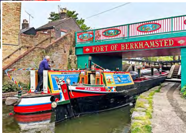
May: at Berkhamsted on the way home