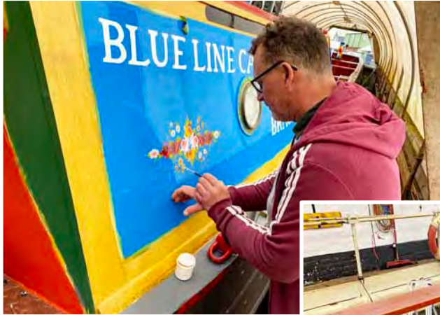
March: painting Nutfield at Brinklow