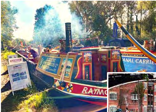
September: Nutfield & Raymond at Huddlesford