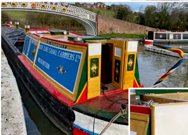
December: Nutfield with new doors grained and decorated by Will.