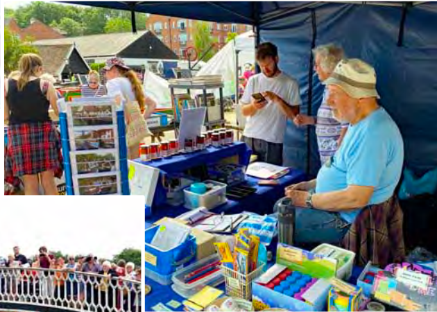
June: Braunston Historic Rally, FoR sales stall