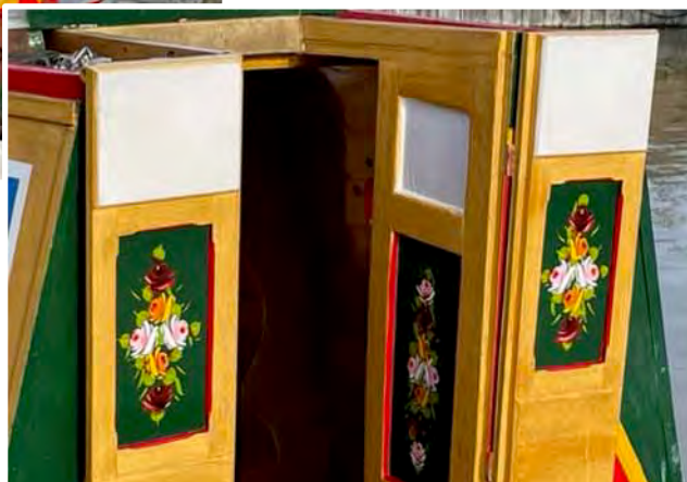
December: Details of Will's roses on Nutfield's doors and weather board – Will added the castles the following Easter.