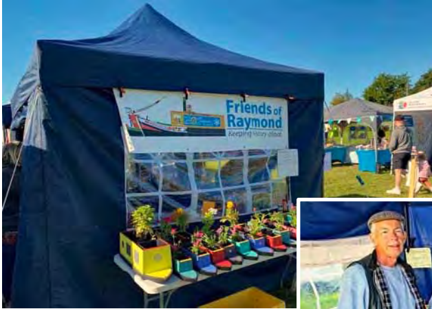
September: the FoR gazebo at Huddlesford