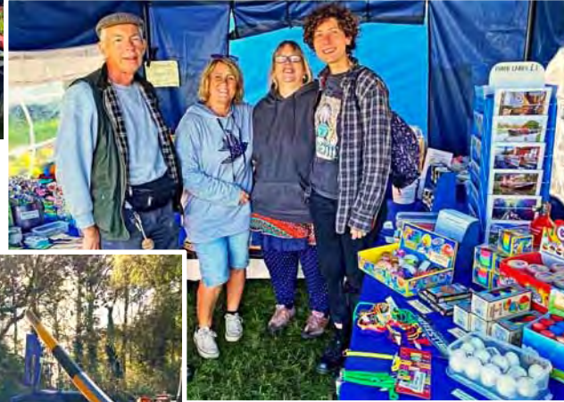
September: the FoR team at Huddlesford