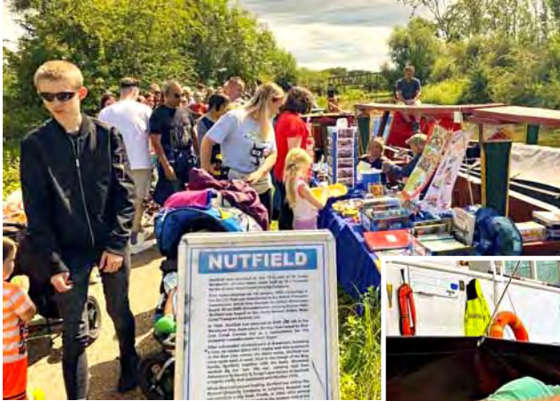
July: but a sunny day a week later at Linslade