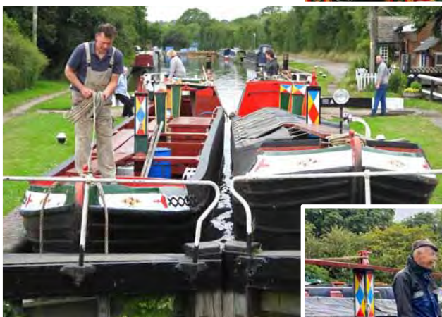
July: in Buckby Top Lock, going to Cosgrove