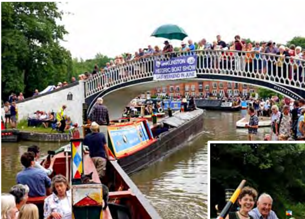
June: Braunston Historic Rally, opening parade