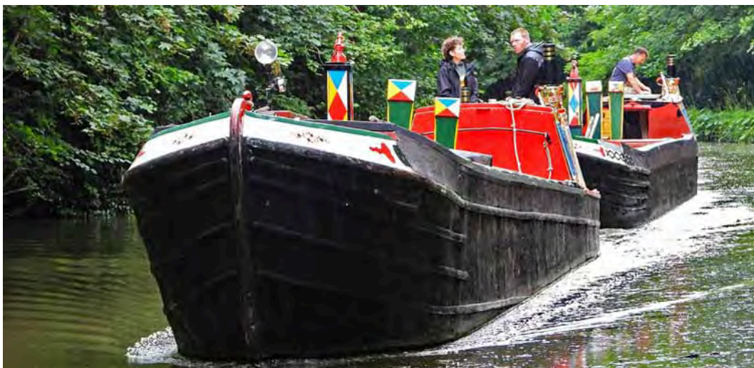
July 2023. Nutfield & Raymond going to Cosgrove pass through Brockhall Spinney below Buckby

There are a number of articles and pictures that, regrettably, never got published. So in this issue, we will start catching up with a montage of pictures from our busy year in 2023.